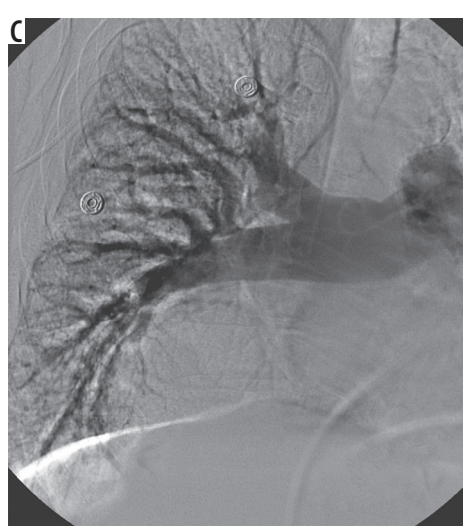
Figure 1. A) Emboli in the right pulmonary artery causing perfusion defects. B) Arrow-Trerotola in place in the artery to the lower lobe. C) Result after the endovascular treatment with improvement of the perfusion

(Boston Scientific, Helsingborg, Sweden), an Arrow-Trerotola positioned over the wire percutaneous thrombolytic device (PTD – Arrow Int. Inc., Reading PA, USA) [20] was advanced into the pulmonary trunk, and fragmentation of the emboli in the main and segmental branches was performed. Aspiration of emboli was done using an 8 F JR4 guiding catheter (Cordis). In three patients CDT was administrated though a 4 F Cobra C2 catheter (Cordis) or a 4 F MPA catheter (Terumo) placed with the tip in the embolus in the main right or left pulmonary artery, using alteplase (Actilyse, Boerhinger Ingelheim AB, Stockholm, Sweden). The results of all the treatments were verified during the procedure by multiple contrast injections and by final angiography (Figure 1A-C).