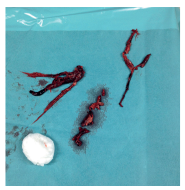
Figure 2. Aspirated emboli

During follow-up (up to 42 months) nine patients expired. One died due to pneumonitis after three days, and one due to anoxia of the brain following heart arrest (reversed prior to the procedure) after 12 days. One patient expired due to aortic dissection more than one year after treatment, two due to unknown causes after more than six months, and the others later due to underlying disorders.